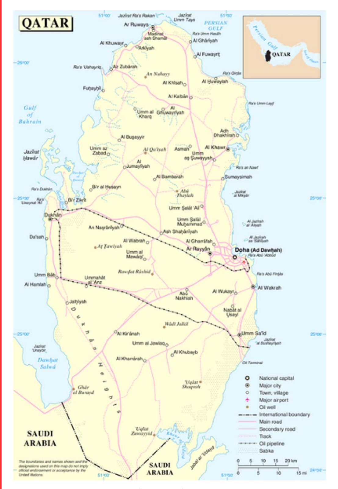
Figure 1. Map of Qatar.

Depressive symptoms have been shown to be strong independent predictors of mortality, worse health status, poorer compliance [39], recurrent cardiac events, and increased health care use [36]. A recent extensive review of the link between depression and cardiovascular disease by Nemeroff and Goldschmidt-Clermont (September 2012) revealed that depression is associated with increased risk of