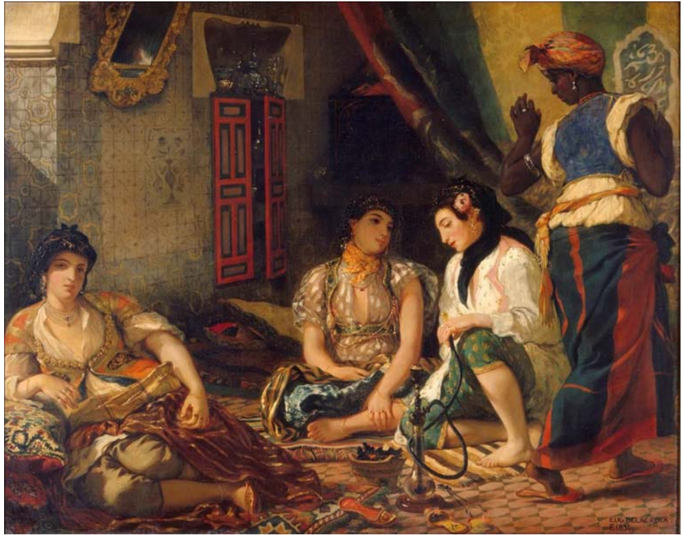
Figure 3. Delacroix, Eugene. The Women of Algiers . 1834. Oil on canvas. Wikimedia Commons. Web. March 19, 2013.

The agency of Essaydi's subjects, in conjunction with the unique materials and techniques employed in her images, gives voice to both artist and models, who now "speak in the language of femininity to each other... just as my photographs have enabled me to speak." 13 In Essaydi's re-vision of Delacroix's work, both the "forbidden gaze" (of the Western artist entering and representing the space of the harem normally unavailable to him) and "severed sound" (the agency or voice denied his female sitters) of the original painting are subverted. At the same time, the physical containment of her subjects "in their 'proper' place, a place bounded by walls and controlled by men," 14 recalls the restriction of women