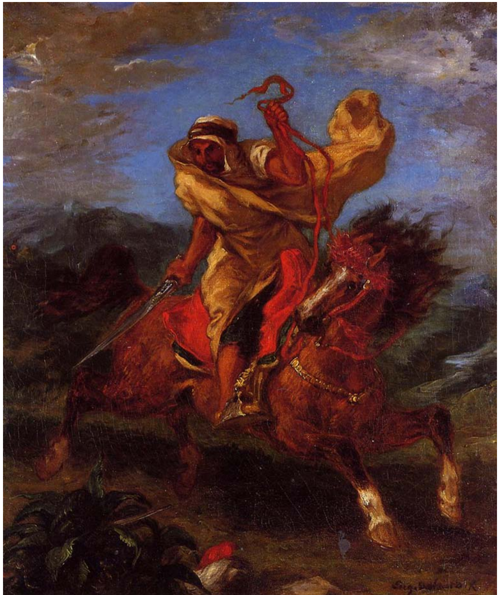
Figure 2. Delacroix, Eugene. Arab Horseman at a Gallop . 1840s. Oil on canvas. WikiPaintings. Web. March 19, 2013.

seductive interplay of colors, textures, and subtly bared flesh. In her photograph, these elements are replaced by pale neutral surfaces, webs of hennaed calligraphy, and veiled, wrapped or otherwise covered female figures (Figure 4). In this way, she reinstates what she describes as “the private space of the veil” 11 while emphasizing the self-containment of her female subjects, none of whom acknowledge or engage directly with the viewer. As the private space of her models is reinstated, the controlling gaze of the male artist long associated with Western Orientalist images of women is disrupted, and with it the voyeuristic experience suggested in Delacroix’s original image and stated blatantly in Picasso’s later variations on it executed in 1954–55. Essaydi’s subjects are further empowered by the performative nature of her photographs, which are a collaborative effort between the artist and her models, who are “family acquaintances” rather than hired professionals. The henna applications they undergo require hours of preparation, as do their rehearsals for the staging of the image to be photographed. The artist explains that