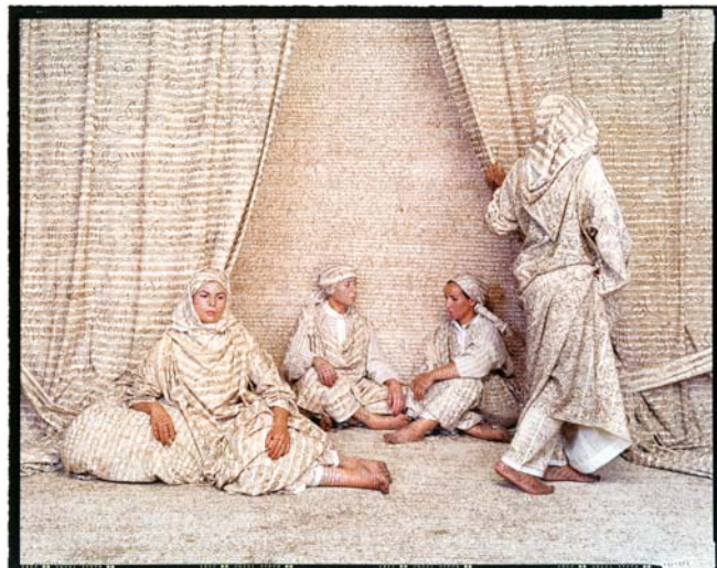
Figure 4. Essayi, Lalla. Les Femmes du Maroc #1 . 2005. Photograph. Lalla Essayi. Les Femmes du Maroc . Brooklyn, NY: powerHouse Cultural Entertainment Company, 2009. 21. Print. [ Les Femmes du Maroc #1 , scanned April 2, 2013] Permission to publish to be obtained.

The agency of Essaydi's subjects, in conjunction with the unique materials and techniques employed in her images, gives voice to both artist and models, who now "speak in the language of femininity to each other... just as my photographs have enabled me to speak." 13 In Essaydi's re-vision of Delacroix's work, both the "forbidden gaze" (of the Western artist entering and representing the space of the harem normally unavailable to him) and "severed sound" (the agency or voice denied his female sitters) of the original painting are subverted. At the same time, the physical containment of her subjects "in their 'proper' place, a place bounded by walls and controlled by men," 14 recalls the restriction of women