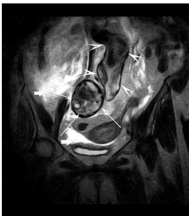
Figure 2. T2W coronal image showing dilated tortuous abdominal aortic aneurysm (arrowheads) with a focal saccular aneurysm in the right iliac artery (arrows) and intraperitoneal extension of the hematoma (thick arrows) into the paracolic gutters and into the pelvis.

described as focal representation of a systemic vascular disease. It was also thought to be a complication of atherosclerosis, and rupture was thought to be a simple mechanical process where the wall of the aneurysm gives way due to increased hemodynamic stress. (3) Pathophysiology of AAA is now presumed to be secondary to inflammation and excessive extracellular matrix breakdown leading to aortic expansion and formation of aneurysm.