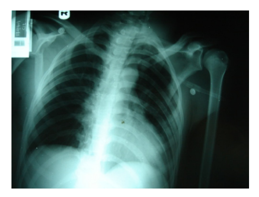
Figure 3. Six months post-op. chest X-ray.

0.7–2.8% [16]. Though the incidence is low, tracheobronchial disruption has a high potential for rapid progression to death. The mortality rate may be up to 30%. Half of the children with tracheo-bronchial disruption died within one hour of the traumatic event [10].