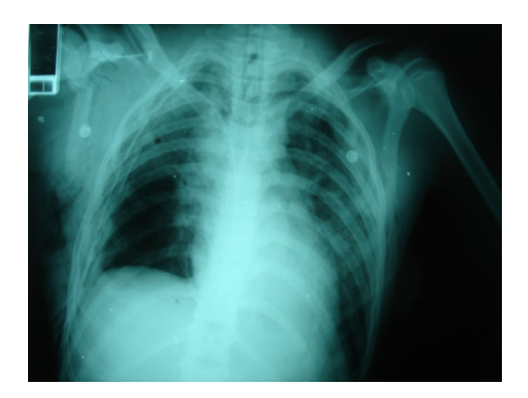
Figure 2. Immediate post-op. chest X-ray.