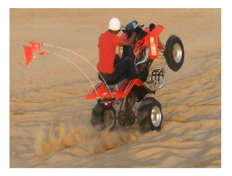
Figure 1. Photo of unsafe ATV operation-performing "wheelie".