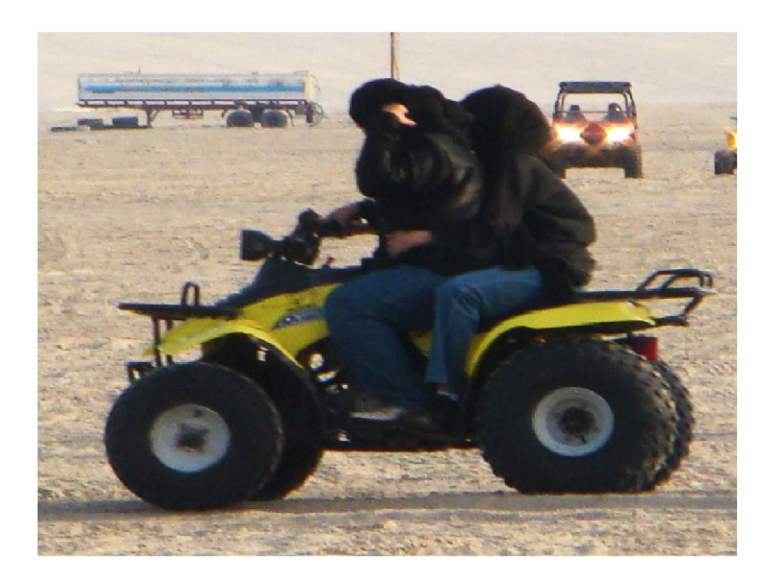
Figure 2. Photo of unsafe ATV operation – carrying passenger.

Since ATVs are designed for interactive operation, drivers must be able to shift their weight to maintain balance in response to variations in terrain and other conditions. Carrying passengers restricts the interactive nature of the ATV experience and increases the chance of rollovers (Fig. 2). Children should not ride ATVs designed for adults. Most childhood deaths and serious impairments come from children riding ATVs designed for adults. Other educational messages relate to eliminating alcohol and other drug use which impair reaction time and judgment, two essential skills for safe ATV operation. Alcohol and other drug use are known contributing factors to ATV crashes (4). Hands-on safety training courses are available and data shows that drivers with hands-on ATV training have lower likelihood of injury than drivers with no formal training. The cost for such courses is modest. Other beneficial safety initiatives consist of use of proper safety equipment, including helmets designed and approved for off-road vehicles, and limiting use to off-road environs. Driving ATVs on roads or highways is dangerous. Most ATVs have fixed rear axles which do not allow the inner rear wheel to rotate freely when turning, causing sudden release of torque which, on firm surfaces, promotes lurching and loss of control.