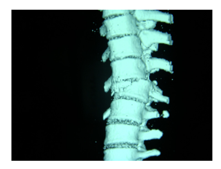
Figure 3a. Spine CT with reconstruction showing comminuted fracture of 12th thoracic vertebra with displacement in young man rendered paraplegic following ATV crash.