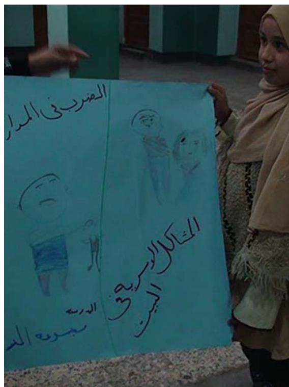
Figure 2. Domestic violence was only mentioned by one group of children

As mentioned in the methodology, it was not possible to get children's perspectives about personal status disputes. However, when we look at their broader views expressed during the pilot activities, it is evident that children do not openly highlight violence in the home as a source of risk. Recurring concerns mentioned by children were pollution, drug use, car accidents, and revenge killings. Domestic violence was only mentioned by one group of children (Figure 2).